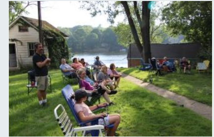
Watching the Bags Tournament at our annual picnic August 2024